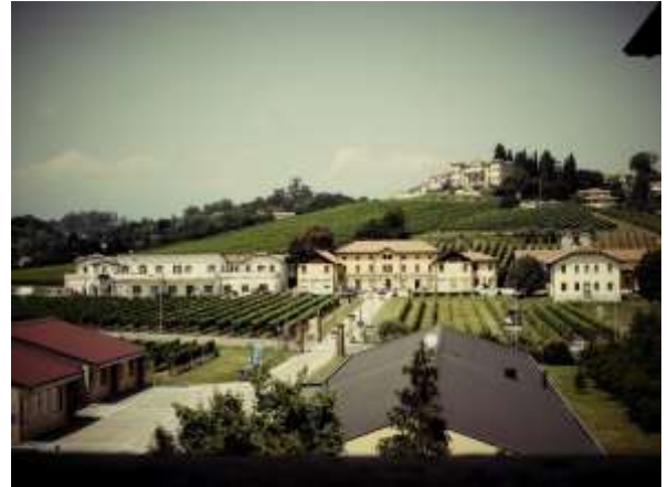
“Bottega del Vino Italiano” (wine shopping hall)